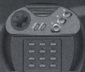
Fig 5. Game Controls