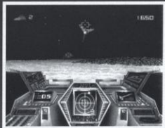
Fig 6. Hovercraft Cockpit

Flares: Not really a weapon, but an aid, to assist on missions on the dark sections of the planet. Use just like mortars.