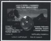
Fig 3. Select Mission Use Joypad left and right to select different missions.

The Federation has analyzed the reconnaissance reports and has divided your mission targets into six increasingly difficult levels, the last being the mission to knock out the atmospheric cannons to allow the armada to enter the planet's atmosphere. Each level consists of missions in different terrain and with different strategic targets; a mission can only be completed when the strategic targets are destroyed. You may choose from the selection of missions by using the left and right Joypad buttons. Details of each mission's reconnaissance report will be revealed to you once you select the mission by pressing the B button.