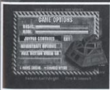
Fig 7. Options menu During gameplay, hit pause and the A, B or C button to bring up this menu.

Abort Mission: Use the left/right Joypad to abort the mission or cancel to return the previous Option menu.